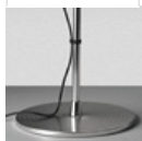
TOLOMEO TERRA BASE + ASTA A012820